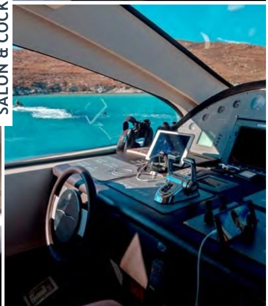
SALON & COCKPIT