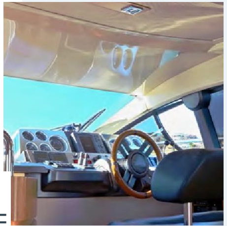
SALON & COCKPIT