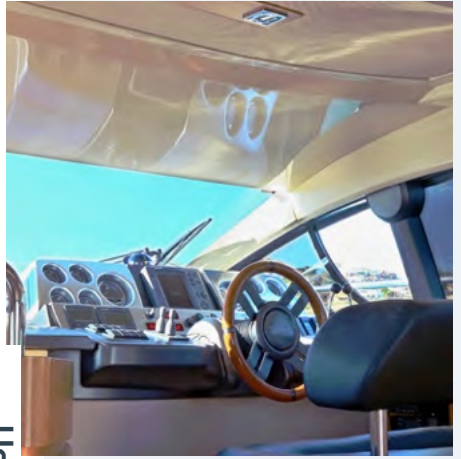
SALON & COCKPIT