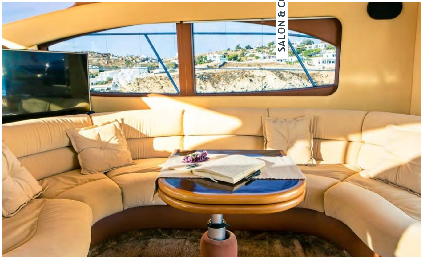
SALON & COCKPIT