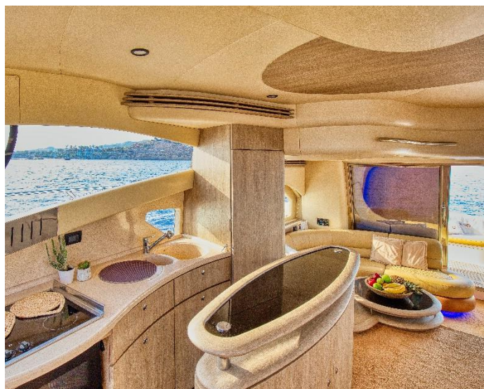
SALON & COCKPIT